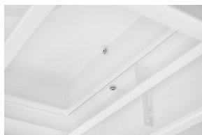
Pressure measurement point, detail