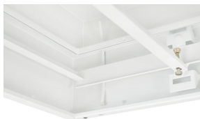
Internal measuring tube to sample particles for measurement