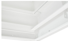
Test groove, detail