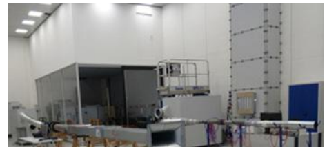
TEST FACILITIES CONTROL TECHNOLOGY