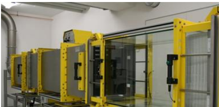
FOR THE HIGHEST DEMANDS LATEST TECHNOLOGY