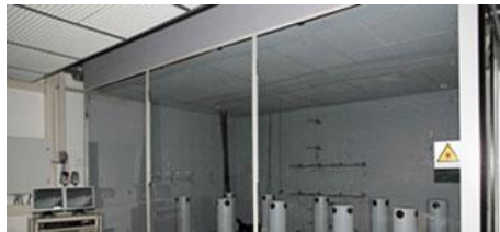
TEST FACILITIES AIR DISTRIBUTION TECHNOLOGY