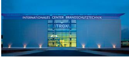
INTERNATIONAL CENTER FOR FIRE PROTECTION AND SMOKE PROTECTION