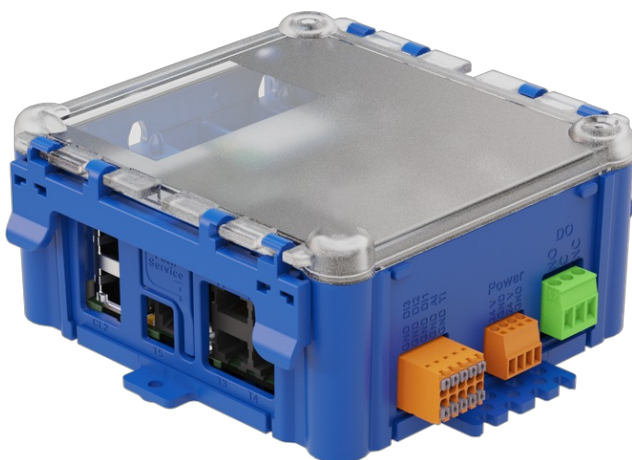
FAM Module RadioDuct, view 1