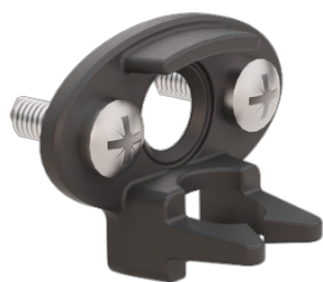
Antenna feed-through, part of the supply package