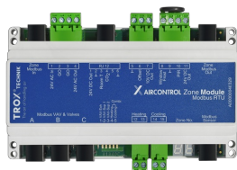
Modbus zone module X-AIR-ZMO-MOD