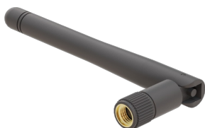
Antenna, part of the supply package